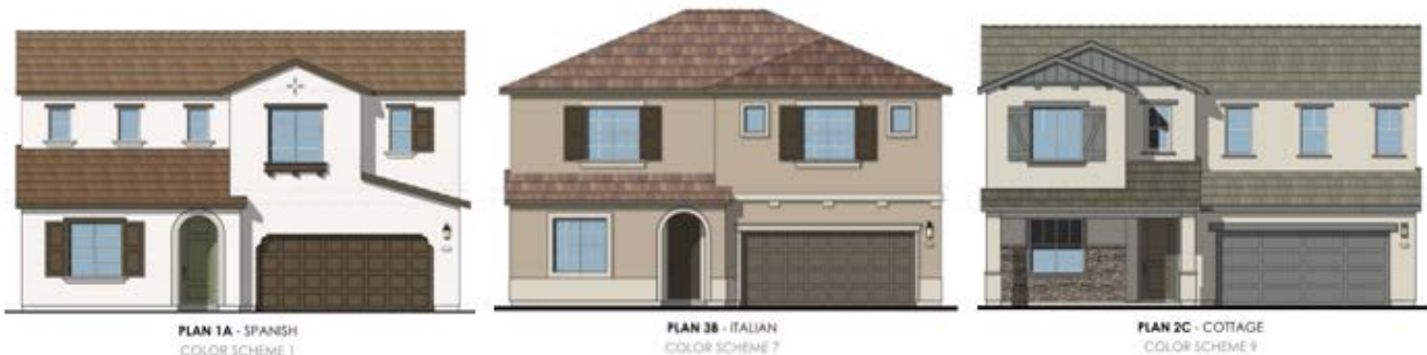
Figure 2: Example Unit Mix

Colors and Materials: Each of the architectural styles have four color schemes primarily consisting of generally natural or neutral tones. Stucco wainscoting and a stacked stone veneer are applied creatively to the elevations to add texture and interest to the façade. The unit designs include a range of decorative embellishments (i.e. shutters, decorative foam trims, and gables) and exterior finishes (i.e. stucco, simulated wood finish, and stone), creating a diverse streetscape that provides visual interest. The proposed colors and materials are included as Exhibit C.